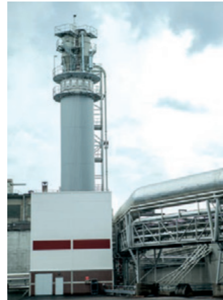
▲ Ortviken's 250 m 3 tower for wood powder storage. It includes special equipment and protective systems to conform to ATEX explosion risk directives.