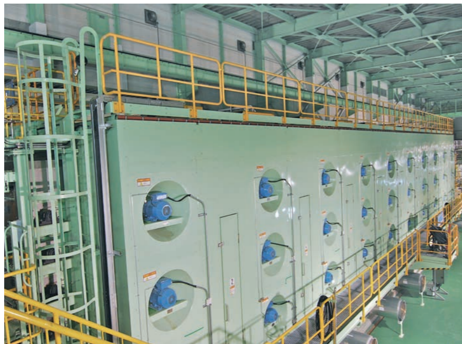
ANDRITZ delivered the entire pulp drying system, including a twin wire press, two-nip heavy duty presses, an airborne dryer, cutter layboy, baling line, and the reel and winder. Design production rate is 300 t/d. Trim width is 2.4 m. Either bales or rolls can be produced, based on customer needs. ▶

Yoshida of ANDRITZ comments, "Oji Yonago has a great approach to problem solving. They worked closely with us to fully optimize the continuous pulping system,