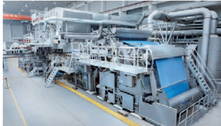
◀ The first of the twin PrimeLineCOMPACT machines at Hebei Yihoucheng – TM1. Working width is 2.85 m and design speed is 1,600 m/min.