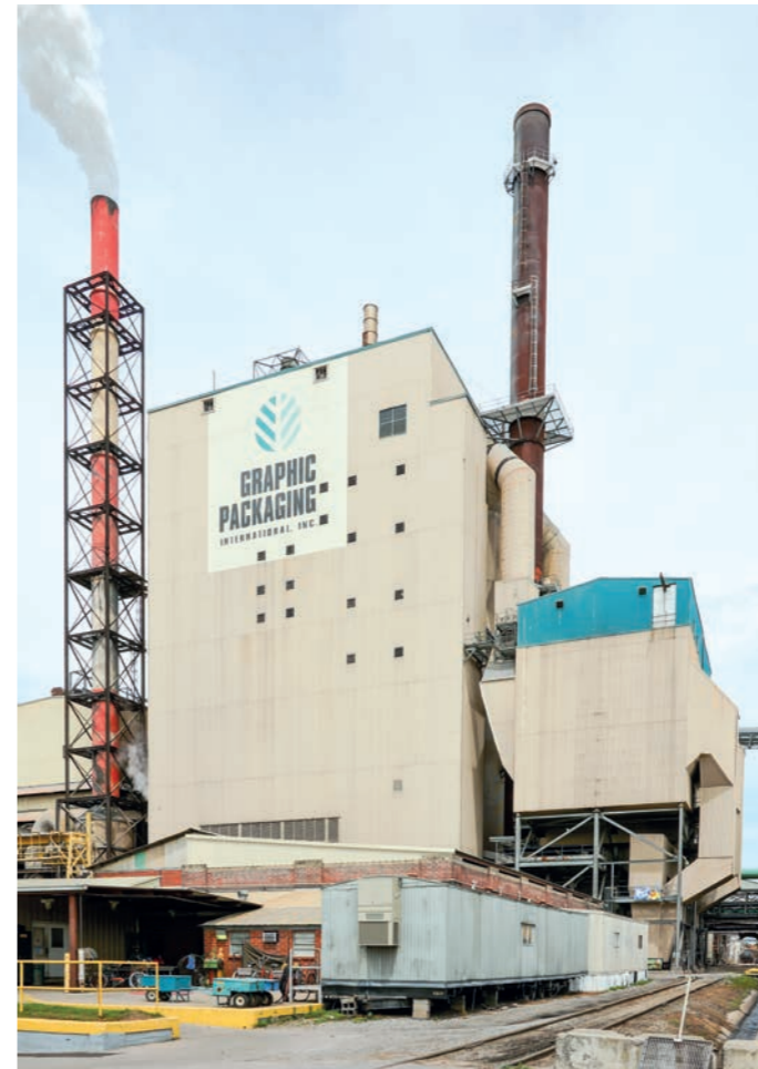
▲ An ANDRITZ recovery boiler was delivered on an EPC basis in 1993-94 and established a good reference for ANDRITZ at the mill.