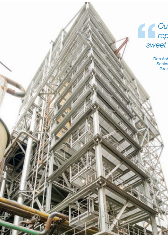
▲ Due to the tight location, the boiler was erected in a unique way. A corner stair support was eliminated so that erectors could bring in the boiler bottom last after other modules were lifted into place.