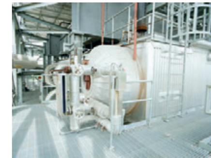
◀ Single steam drum

system also has the capability to combust up to 7.5 t/h of clarifier sludge from the paper mill. Natural gas is used as the start-up fuel. About 23% of the total biomass used at the mill comes from in-house wood processing for the pulp mill. The rest is procured in the open market. In total, the two power boilers consume about 120 t/h of biomass.