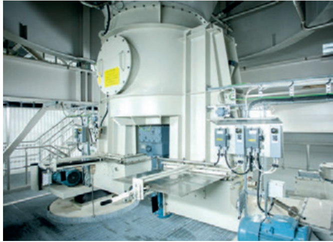
▲ Inside the plant: part of the distribution system for splitting the pulverized wood powder between the two boilers.