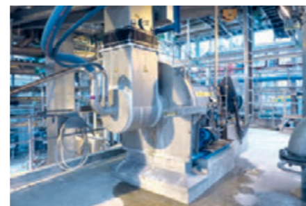
The unique HC Mixer helps to achieve very high brightness with low chemical consumption. ▼