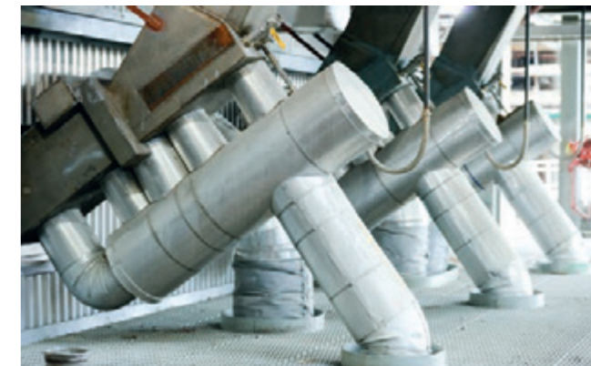
▲ Fuel feeding ports in the boiler