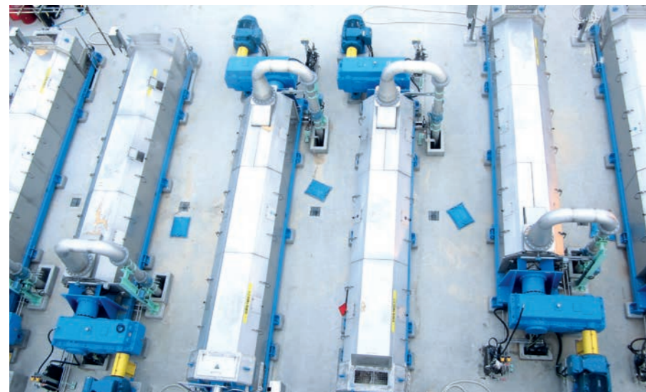
◀ Six new ANDRITZ pulp screw presses are key to achieving the proper consistencies for bleaching and washing.

“ANDRITZ was receptive and obliging and provided good support to ensure the process was kept as simple as possible within the space constraints,” Ayling says.