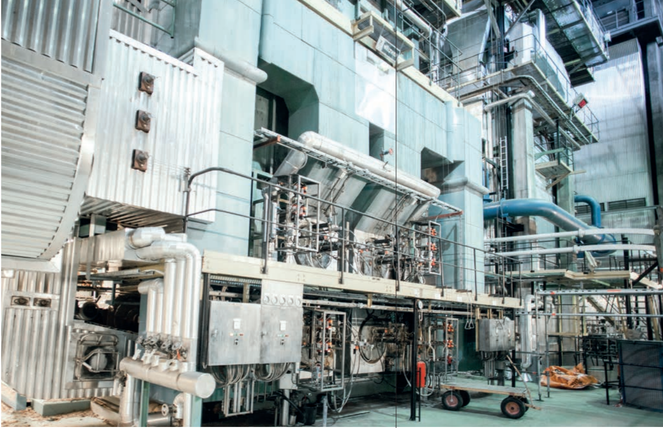
▲ ANDRITZ's rebuild of the first boiler, which included the installation of four multi-fuel burners for oil or wood powder, started up before Midsummer. The second boiler, also a 100 MW unit, was rebuilt during August-September. ANDRITZ installed three new multi-fuel burners to accompany the one oil burner for bark. Connections and upgrades for the electrostatic precipitators were completed in November.

wood processing experts in Örnsköldsvik, Sweden have the engineering knowledge and process expertise to design and build the plant for converting pellets to powder and convey the powder, including the special equipment and protective systems needed to conform to ATEX directives (EU rules protecting employees from explosion risks)."