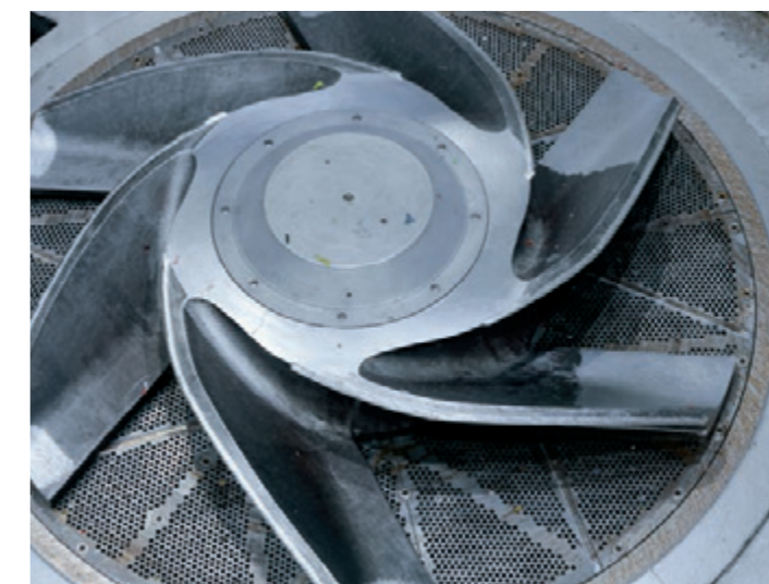
◀ Rotor inside the FibreSolve FSR pulper with 130 m³ vat.

CONTACT Pulping & Fiber alexander.singer@andritz.com Paper & Board olli.maltonen@andritz.com