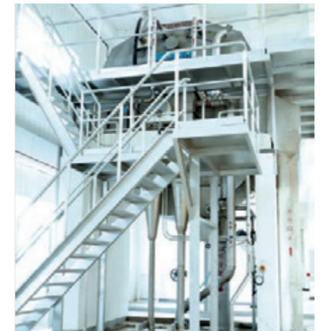
▲ Conservation and reuse of water is critical at this mill. The ANDRITZ stock preparation system, including the disc filter (above) helps save fresh water.

The COMPACT approach reduced the time it took to install and bring the machine along the start-up curve. "Even though our people are not veteran operators, they were able to start up and ramp up very fast with ANDRITZ's training and guidance," says Mr. Tian. "Within days we were producing excellent paper. We started in the 15 to 17.5 grammage range and, based on early success, our operators are quite confident to produce other grades."