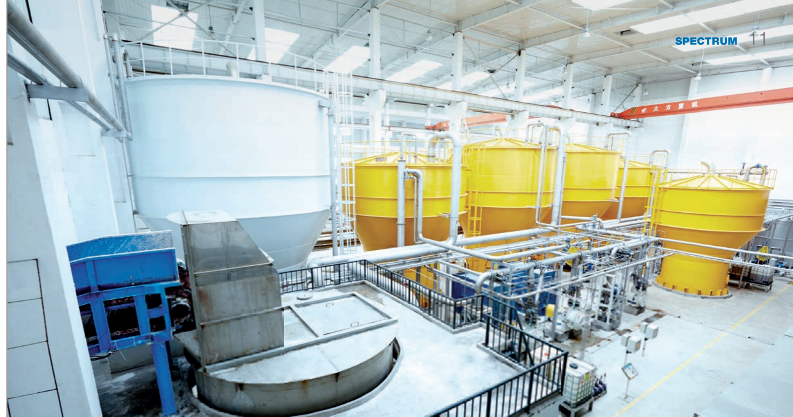
▲ ANDRITZ delivered the complete stock prep and machine approach system including pulping, thickening, pumps, and agitators. The process includes two FibreSolve pulpers for incoming kraft pulp bales, refining, deflaking, disc filter, screens, and fan pump.

machine. "The performance of the Steel Yankee exceeds the performance of cast iron," he says. "It has a much higher evaporation rate and improves drying with less energy consumption. The energy savings are quite noticeable."