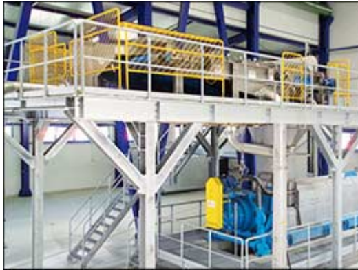
▲ ANDRITZ Gravity Table GT and Sludge Screw Press SCS