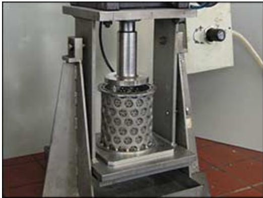
▲ Sludge testing equipment in the laboratory in Graz, Austria