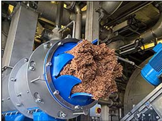
▲ ANDRITZ Reject Compactor ReCo-L