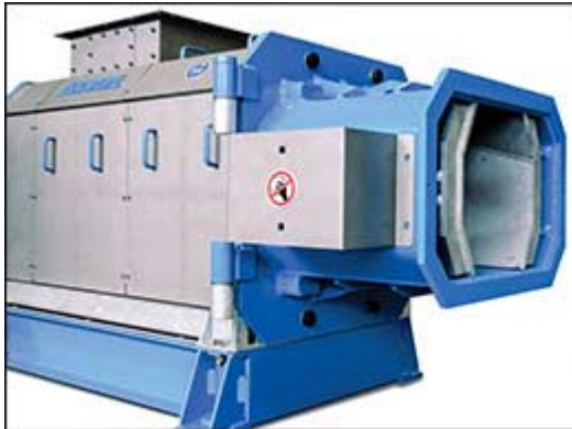
▲ Four units of the ANDRITZ Reject Compactor ReCo will be delivered to Ji'An Group