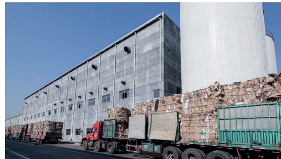
Waste paper arriving at Sun Paper

Rejected waste – it is amazing what can be found in the reject piles.