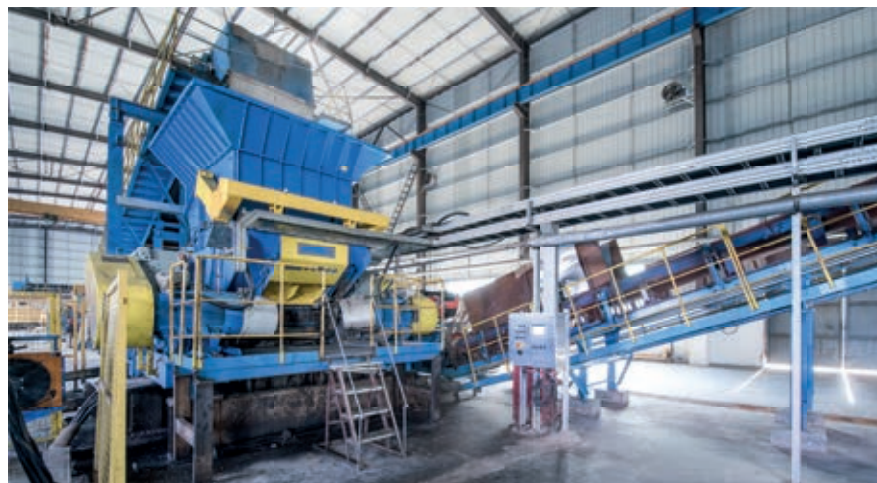
ANDRITZ Fransson Shredder FRX2000